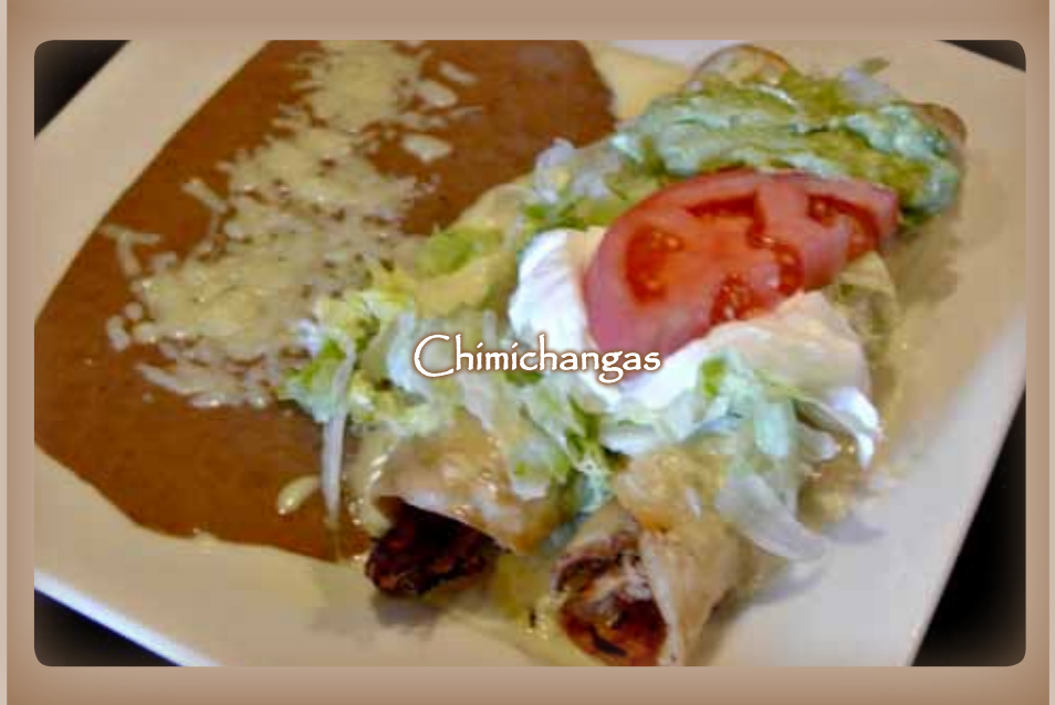
*Consuming raw or undercooked meats, poultry, seafood or eggs may INCREASE YOUR RISK OF FOODBORNE ILLNESS.