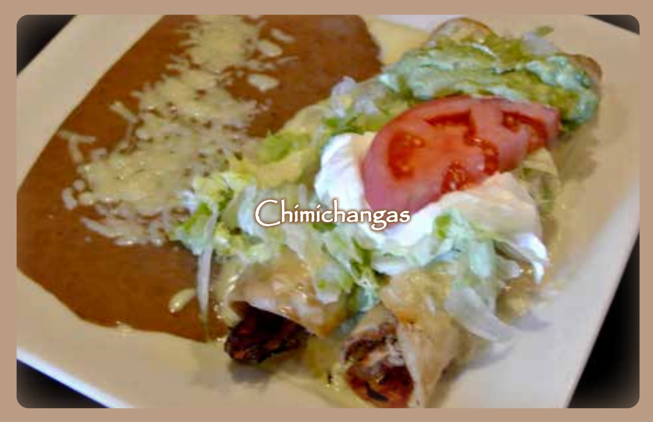
*Consuming raw or undercooked meats, poultry, seafood or eggs may increase your risk of foodborne illness.